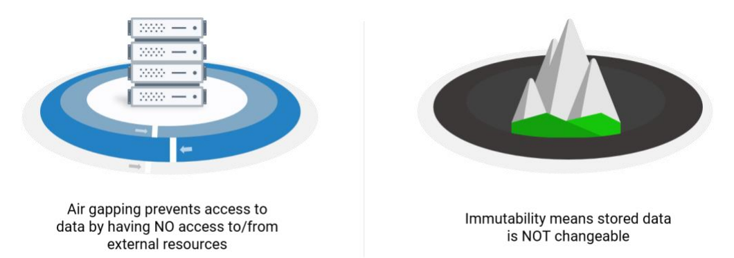
Figure 4. Commvault Cloud Offers Both Air Gapping and Immutability to Protect Stored Data