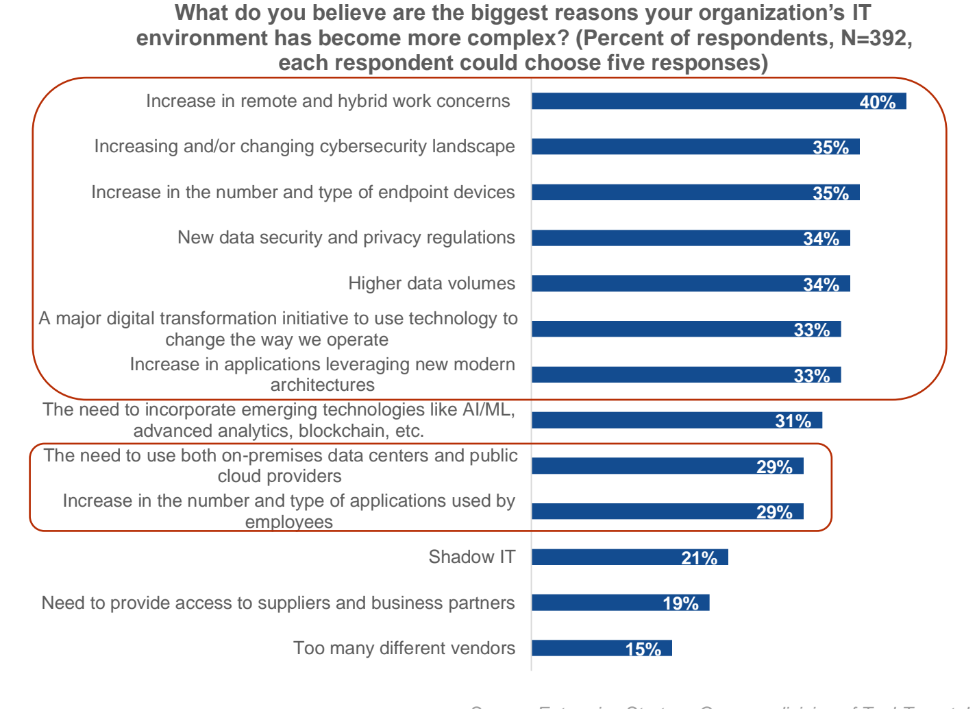
Figure 1. 9 of the 13 Top Reasons for Increasing IT Complexity Directly Map to New Cyber Resiliency Challenges