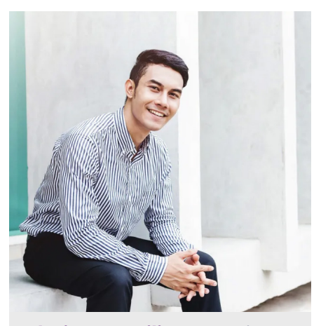
Platinum Resilience package offers the highest level of protection, combining all capabilities with Commvault's Ransomware Recovery Protection Plan.

To learn more or schedule a demo, visit: commvault.com/packaging