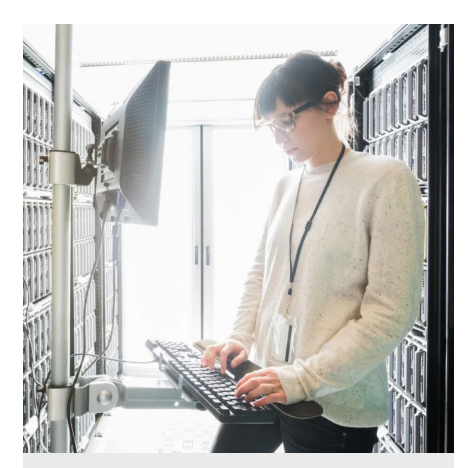
Cyber Recovery package includes advanced features like sensitive data discovery, automated risk remediation, and threat detection.