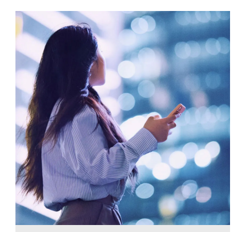
Operational Recovery package offers essential data security, recovery, and Al-driven automation.

Commvault offers a range of packages designed to meet organizations' diverse needs regarding data protection and management. Our packages provide flexibility, breadth of coverage, ultimate security, and cost savings.