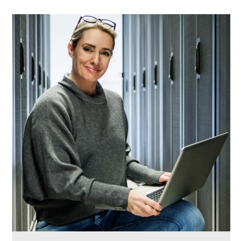
Autonomous Recovery package adds automated validation, live data replication, and rapid recovery capabilities.